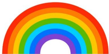
Thorndon CEVC Primary School